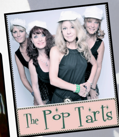
The Pop Tarts

Tickets ONLY $45 (Includes Donation, Dinner & Entertainment)